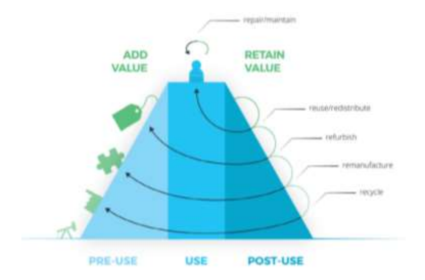
Figure 6 The 'value hill' of circular economics

There is widespread support among cities for the transition towards a circular economy. Part of this transition is improved resource efficiency, meaning reduction of the use of virgin resources and increased use of secondary resources. The basic principles of this can be illustrated by the so-called 'value hill' of circular economics.