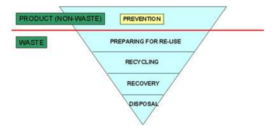
Figure 4: The European waste management hierarchy

The waste hierarchy puts waste prevention at the top of the priorities that public authorities should follow with regards to waste management policy. Yet even though waste prevention principally is to be prioritised, it is rarely an integral part of local waste management.