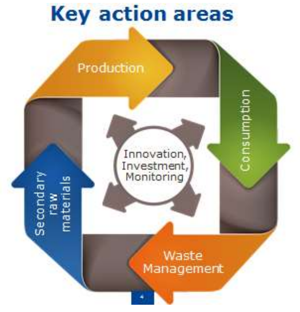
Figure 1 Closing the loop – An EU Action Plan for the Circular Economy (source: DG Environment, October 2016)

However, given time and resource constraints, this scope had to be limited, and the Partnership has focused on the parts of the circle which they believe are most relevant to cities and which they have the greatest potential to influence. To choose among several potential topics and actions, a set of criteria have functioned as guidelines for their screening and evaluation: