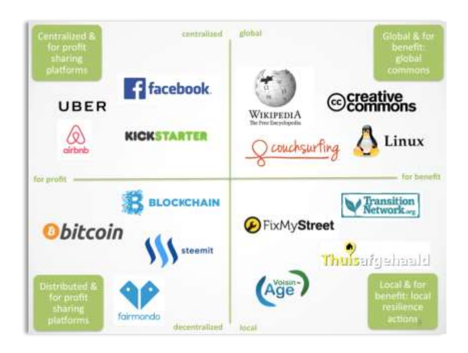
Figure 7 The various sectors of the collaborative economy

However, there is a myriad of sectors with a variety of spectra within the Collaborative Economy. Ranging from for profit to for benefit; from centralised to decentralised; from global to local; and from online to certainly also offline platforms and communities.