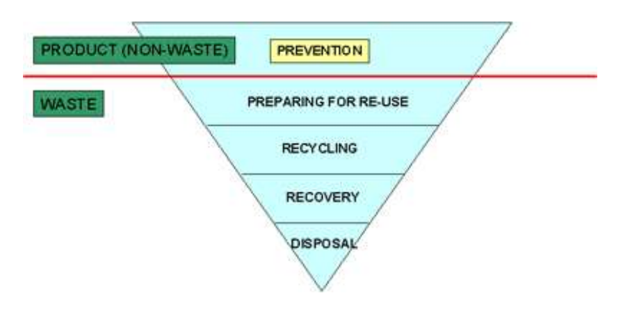
Figure 3: The European waste management hierarchy

The removal of these barriers is important to facilitate the circular economy and to stimulate the uptake of the use of secondary raw materials. This first of all calls for a basic evaluation of the current legislative framework, the implementation and application of that framework, and the definitions of waste in the context of a circular economy. For analytical purposes we will take the European waste management hierarchy as a starting point.