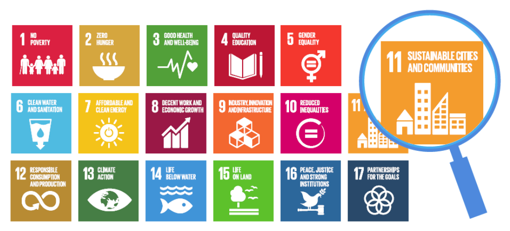
SDG Goal 11: 'Make cities and human settlements inclusive, safe, resilient and sustainable'