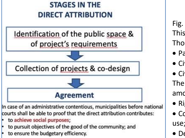
Fig. 3 the steps for a direct attribution to reach the agreement. This last are translated into contracts.

Which recommendations (local/national/EU-level) does the Action deliver [please differentiate the different levels]? What were the important lessons learned and strategies identified to overcome the problem(s) tackled? What could be some next steps and follow-up activities (if applicable)?