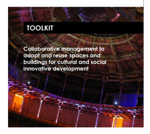
Fig. 2 The toolkit is the synthesis of Activity 1 (Analysis of existing present practices and local regulations) and Activity 2 (Proposal of a model -operational scheme- to foster collaborative management as systematic methods) defined in the Action Plan of the Culture & Cultural Heritage Partnership.

Urban Agenda for EU Partnership on Culture & Cultural Heritage