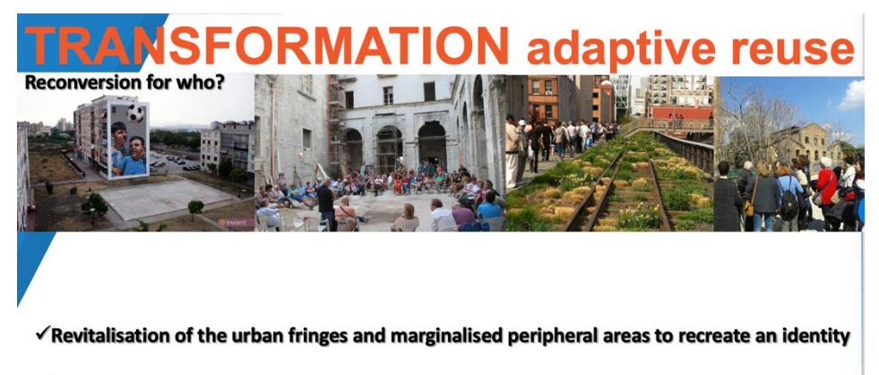
Fig. 1: the working group started to conceive this action at the first working meeting in Bruxelles (10 April 2019), then tested at the European Week of Regions and Cities (9 October 2019), the last physical meeting.

The starting point: What is/are the common problem(s) identified that the Action aims to tackle? Why is the Action important and relevant?