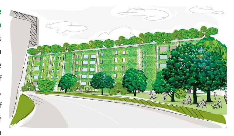
Figure 5: Prato Urban Jungle.

The Prato Urban Jungle project, funded by the Urban Innovative Actions initiative, aims to re-naturalise neighbourhoods in a sustainable and socially inclusive way through the development of green areas. These urban areas, which have a high density of housing and construction, will be redesigned using a green approach. The project promotes a